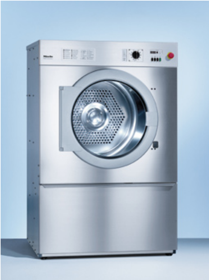
T 6251-T 6751 with conventional drum