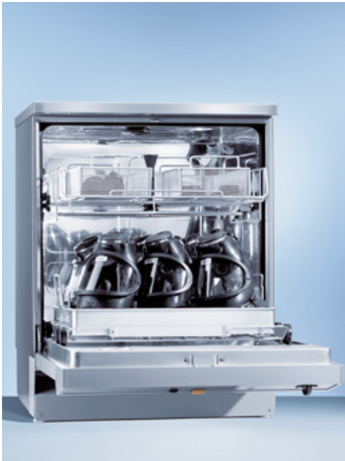
Illustr.: G 7856 with baskets (optional)