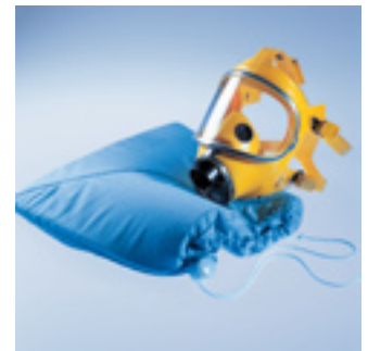
Washer-extractor: Protective bag for breathing masks, BM 02