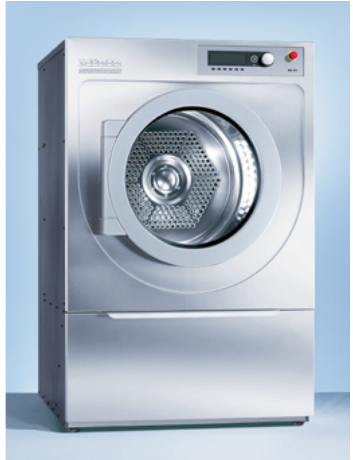
PT 7251-PT 7801 with honeycomb drum