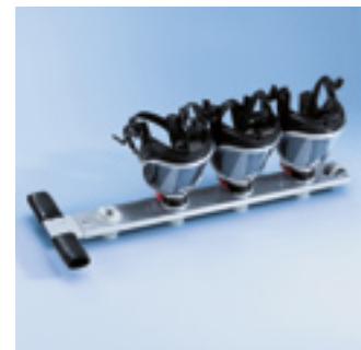
Tumble dryer: Patented mask holder, BHM