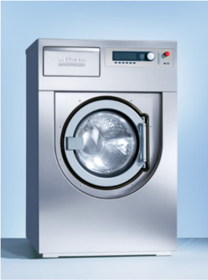
PW 6101-PW 6201