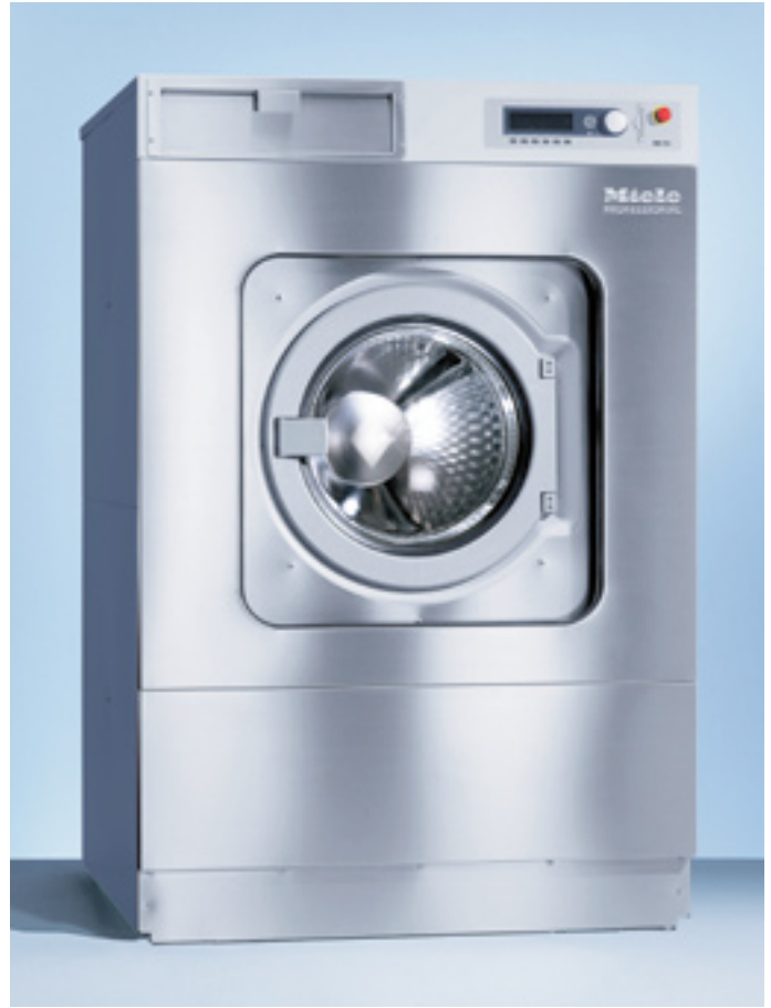
PW 6241 and PW 6321